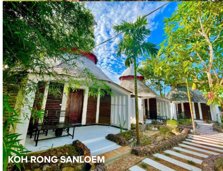
KOH RONG SANLOEM