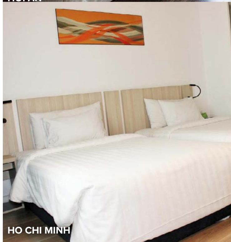
HO CHI MINH