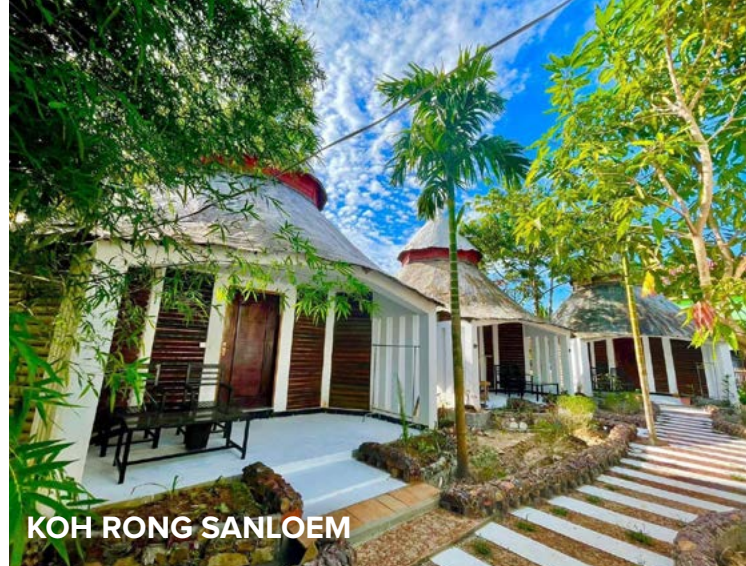
KOH RONG SANLOEM

Twin/Double/Triple Rooms Ensuite Air Con Restaurant & Bar